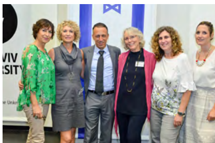
Some of the participants during the myeloma infoday.