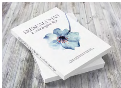
Guide "Sexuality and oncological diseases"

The organisation Kraujas received two grants that were used to organise a myeloma infoday and to develop the book "Sexuality and oncological diseases" for people with cancer and their partners.