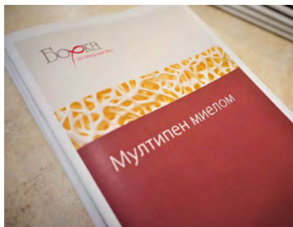
Borka translated into Macedonian the MPE myeloma guide.