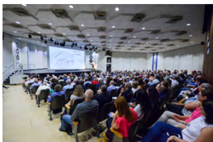
Around 500 people attended the myeloma infoday organised by AMEN.

AMEN Israel applied for two grants, one of them was used to organise their annual patient day that was followed by myeloma awareness month. The other grant was used to develop a volunteer management programme .