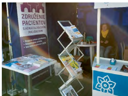
Stand of the Slovakian Association of Patients with Haematological Malignancies during the Marathon.

The Slovakian Association of Patients with Haematological Malignancies created and distributed a guide for GPs about blood cancers and a brochure on social security rights supported by the MPE Scholarship and Capacity Building Programme.