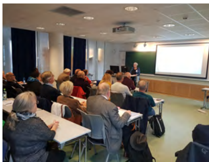
Around 30 participants attended the workshop on patient involvement in myeloma.

Blodkreftforeningen , the MPE Norwegian member, got a grant with the Scholarship and Capacity Building Programme to organise a workshop on patient involvement in myeloma research .