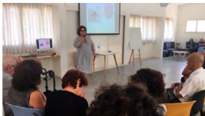
One of the sessions of the volunteers' management programme.