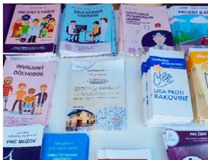
Guides and brochures developed by the Slovakian Association of Patients with Haematological Malignancies.