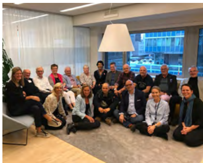
Some participants after the workshop.

Blodcancerförbundet Sweden , the Swedish blood cancer association, got a grant dedicated to organise a combination therapy workshop aimed to discuss the current challenges of these treatments in Sweden.