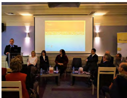
Presentation of the campaign organised by Borka.

Supported by the MPE Scholarship and Capacity Building Programme, Borka organised a patient day and an awareness campaign , translated into Macedonian the MPE myeloma guide and created a myeloma platform .