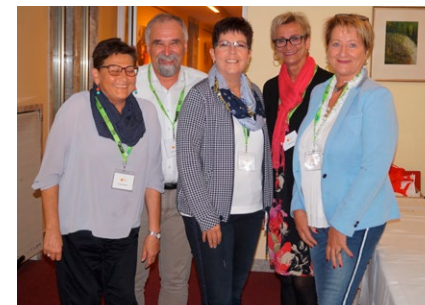
Some of the attendees at the Myeloma Information Day held in October 2019.

"Knowledge is Encouragement". This is the theme chosen by Multiples Myelom Selbsthilfe Österreich to celebrate a Myeloma Information Day. In addition, this organisation is working actively in several activities focused on young myeloma patients .