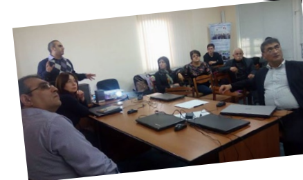
AHA organised seven Myeloma Schools between May and December with patients and doctors.