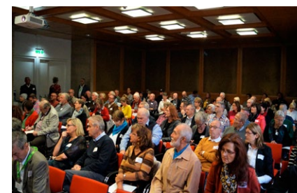
A full house in the Information Day organised by Multiples Myelom Selbsthilfe Österreich.