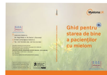
Two of the five educational guides developed by S.O.S Mielom.