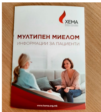
One of the booklets developed by HEMA.

In 2019, HEMA created and distributed two booklets with the support of the MPE Scholarship and Capacity Building Programme on myeloma and fertility and pregnancy .