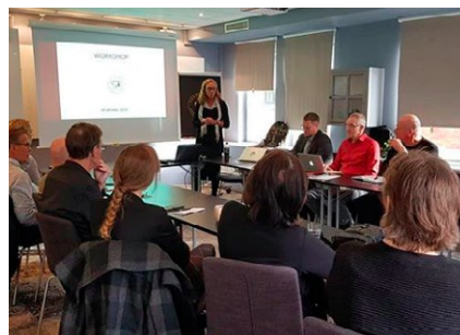
Patient expert workshop organised by blodcancerforbundet

The TBSCA Chairwoman spoke about new treatments in myeloma and challenges in gaining access to these. Invited speakers from the pharmaceutical industry also spoke about the process of gaining access to new treatments in Sweden and how governmental bodies in Sweden calculate the so called "cost effectiveness" of a new drug.