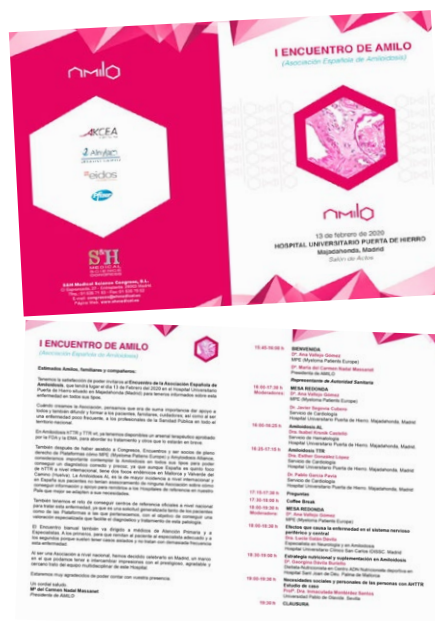
Around 100 patients, carers and doctors attended the Information Day organised by AMILO.

AMILO organised an Information Day attended by 100 people coming from different parts of Spain. This is the first big event organised by AMILO and it will be followed by a number of activities designed for amyloidosis patients.