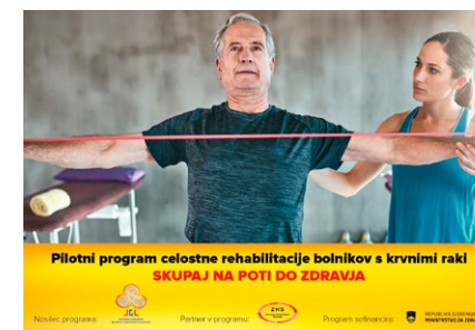
Poster of the campaign developed by L&L.