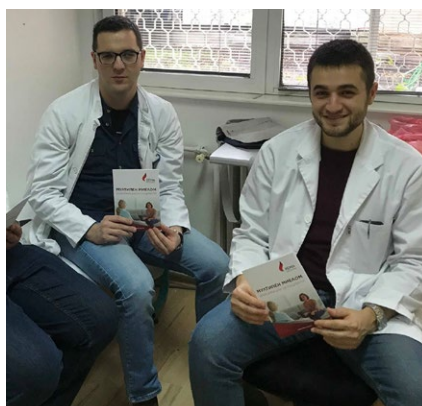
The myeloma information booklet was distributed in the University Clinic for Hematology in Skopje.